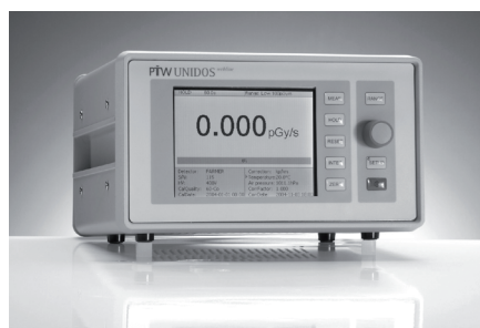
2005 UNIDOS weblin® The first network-enabled reference class electrometer