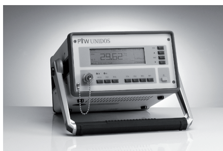
1992 UNIDOS® The first microprocessor-controlled electrometer with 1 fA resolution