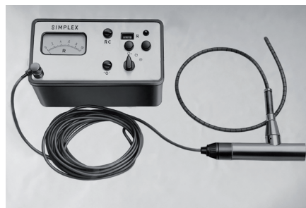
1955 SIMPLEX The first dosimeter with an electron tube